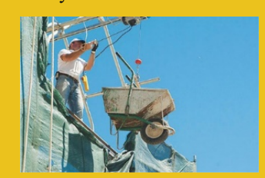
Safety Audit is a systemic evaluation process for highway construction, operation and maintenance safety, which introduces concepts of operation safety and reduction of traffic accident into the feasibility study and design of highway project.